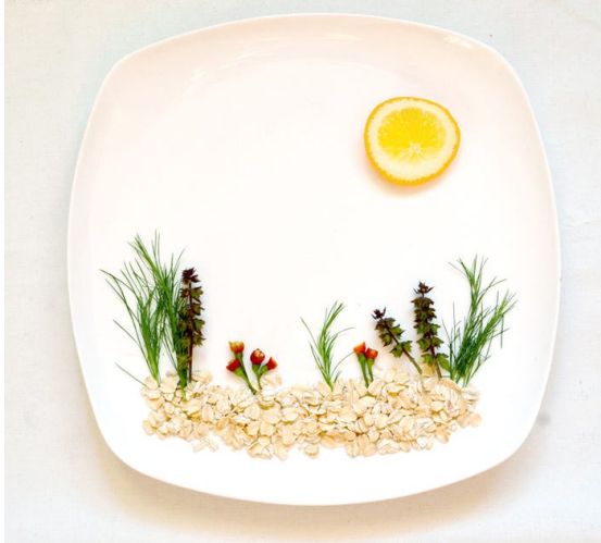
“Red” Hong Yi

The artist challenged herself to making one piece of art a day for a month using only food and a white plate as the backdrop. You can see some of her other creations at