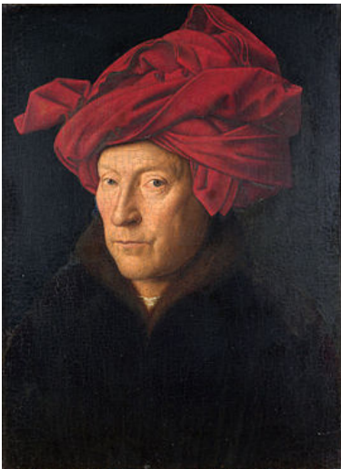
Portrait of a Man, Jan Van Eyck, 1433