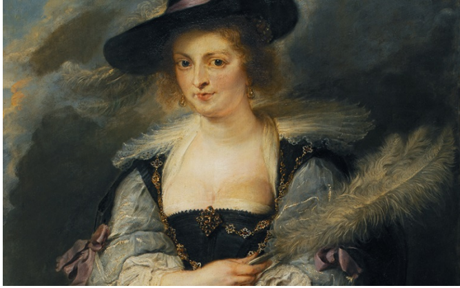
Portrait of Helena Fourment, Rubens, c.1630-1632