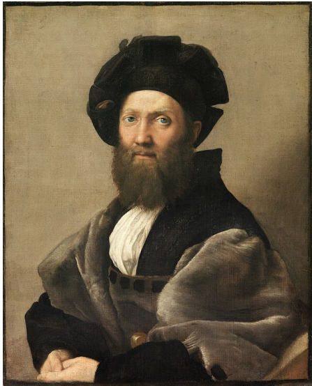
Portrait of Baldassare Castiglione, Raphael, c. 1514-1515