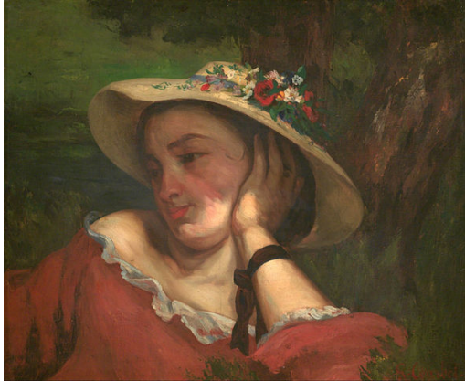
Woman With Flowers on Her Hat, Gustave Courbet, 1857