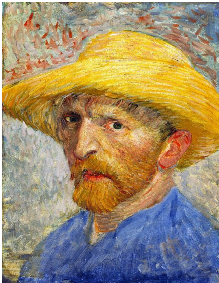
Self Portrait with Straw Hat, Vincent Van Gogh, 1887