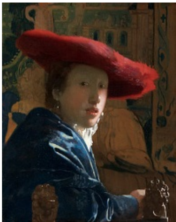
Girl With a Red Hat, Vermeer, c. 1665-1666