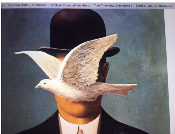
Man in the Bowler Hat, Rene Magritte, 1964