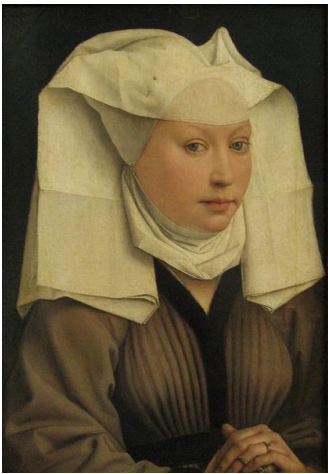
Portrait of a Young Woman in a Pinned Hat, Rogier Van der Weyden, 1435