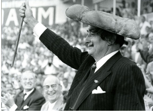
Salvador Dali Wearing a Bread Hat, 1961