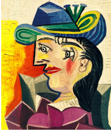
Woman With a Blue Hat, Pablo Picasso, 1939