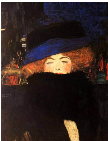
Lady with a Hat and Feather Boa, Gustave Klimt, 1909