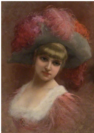
Young Lady in a Feather Hat, Jan Van Beers, 1891