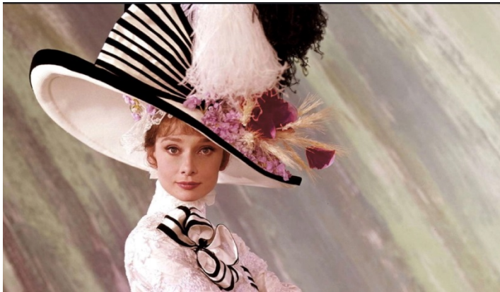
Audrey Hepburn in My Fair Lady , 1964, directed by George Cukor. Film takes place in 1912.