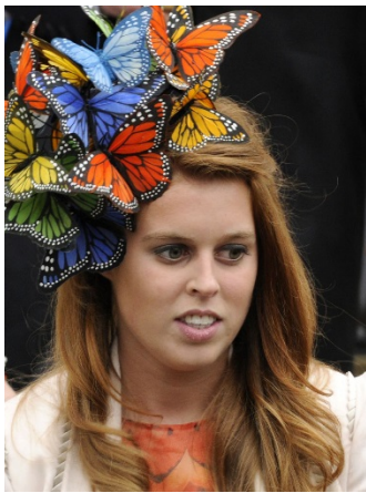
Princess Beatrice at Peter Phillips and Autumn Kelly's Wedding, 2008. Hat by Philip Treacy.