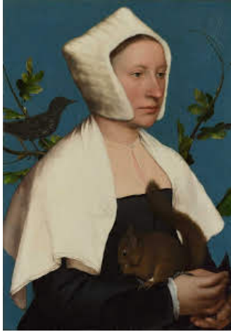
Portrait of a Lady with a Squirrel and a Starling, Hans Holbein the Younger, c. 1526-1528