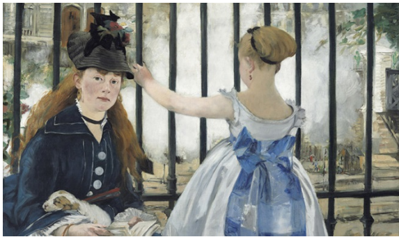
The Railway, Edouard Manet, 1873