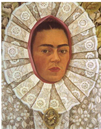
Self Portrait, Frida Kahlo, 1948