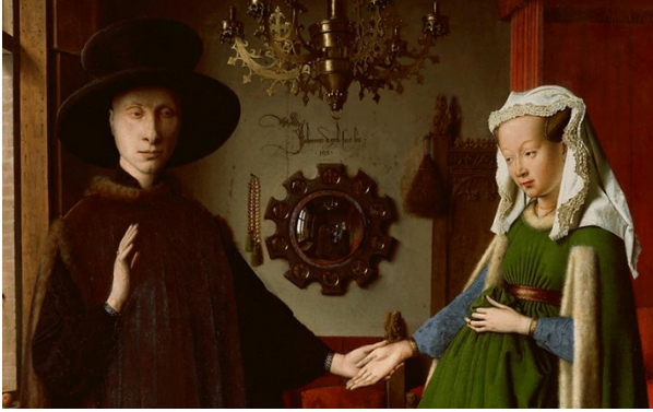
The Arnolfini Portrait, Jan Van Eyck, 1434