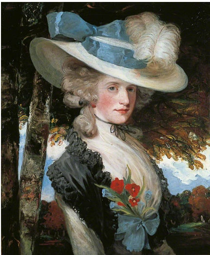
The Honourable Elizabeth Ingram, John Hoppner, 1789