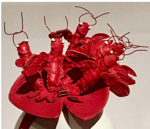
Lobster Hat by Benjamin Green-Field, 1946. Part of the Sand Schreier Collection to be acquired by the Metropolitan Museum of Art, NYC