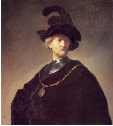
Old Man With a Black Hat and Gorget, Rembrandt, 1631