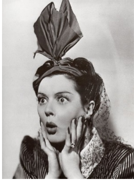
Rosalind Russell in The Woman , 1939, directed by George Cukor