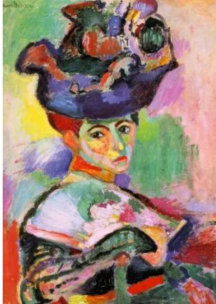
Woman With a Hat, Henri Matisse, 1905