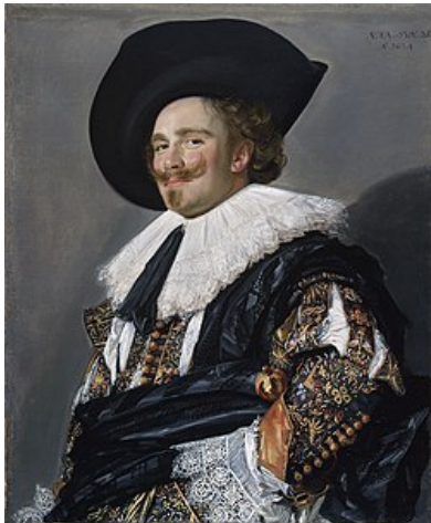
Laughing Cavalier, Frans Hals, 1624