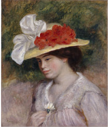
Woman in a Flowered Hat, Auguste Renoir, 1889