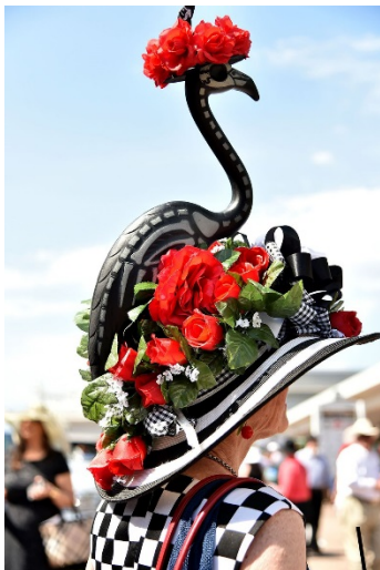
142 nd Kentucky Derby