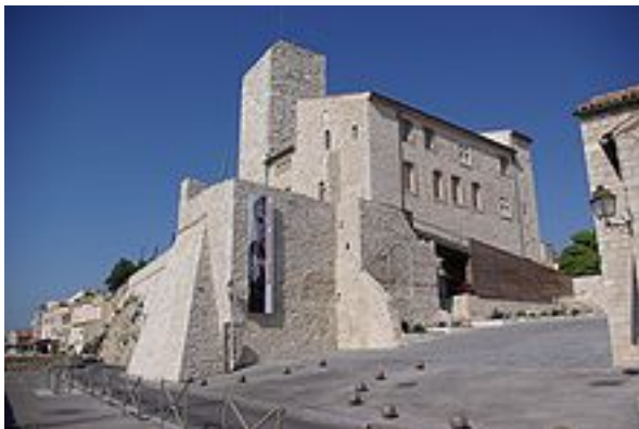
Grimaldi Castle, Picasso Museum, Antibes

https://www.youtube.com/watch?v=7GhzIXcHaRg