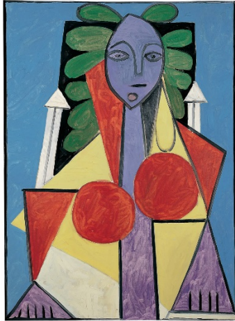
The Face of War, the Face of Peace

The journey ends in Málaga, Spain, the town in which Picasso was born in 1881, where the Museo Picasso Málaga is located. Picasso had offered to donate many works of art, but the dictatorship of Franco precluded any action for decades. After his death, his daughter in law and her son made significant gifts to the museum.