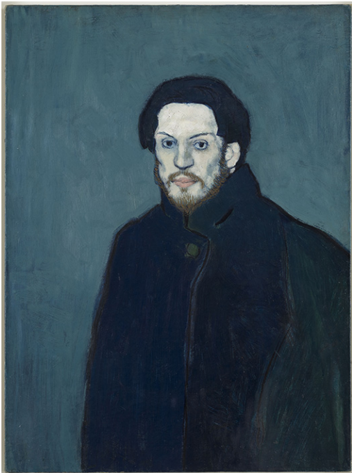
Self Portrait, Pablo Picasso