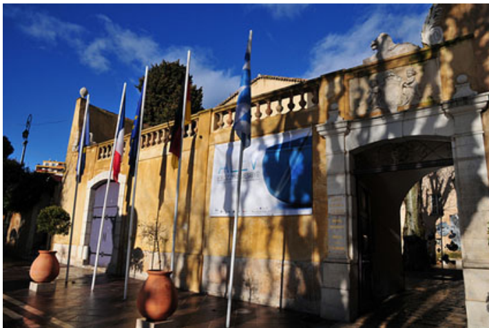
Château de Vallauris

Nearby in Vallauris is the Musée National Picasso, La Guerre et Le Paix. Here Picasso painted two of his greatest post-war works on the walls of a now deconsecrated chapel. One side is Peace; the other is War.