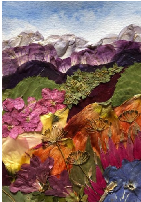
Mountains and Fields Made of Pressed Flowers