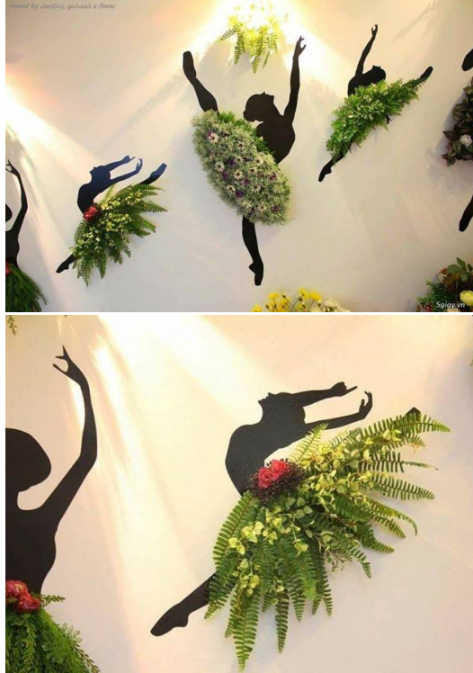
Ballerinas from Facebook page of House of Plants