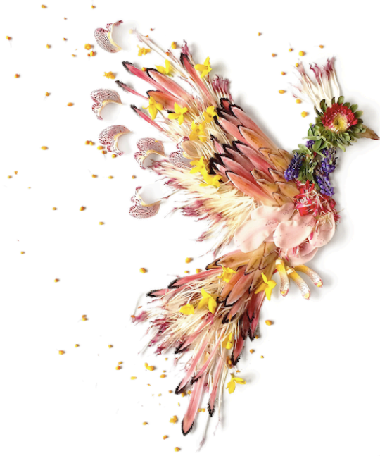
Collage of foliage and flowers by Seattle artist, Bridget Beth Collins