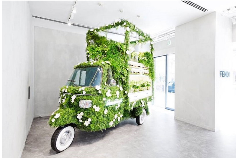
Collaboration between Fendi and botanical artist, Azuma Makota: Pop Up Flower Shop