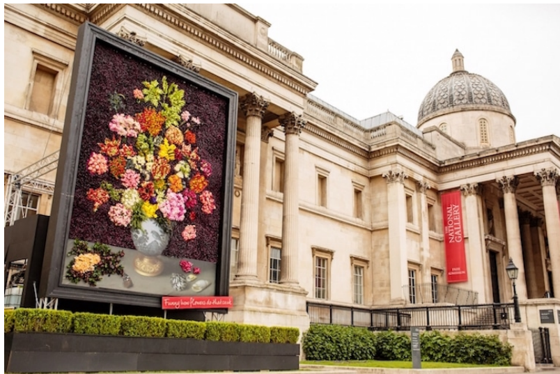
Living Painting at the National Gallery, London. Recreation of a floral masterpiece by Dutch artist Ambrosius Bosschaert the Elder - A Still Life of Flowers in a Wan-Li Vase (1609-10) using 26,500 fresh flowers.