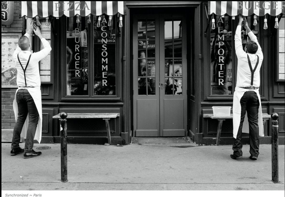
Synchronized ~ Paris