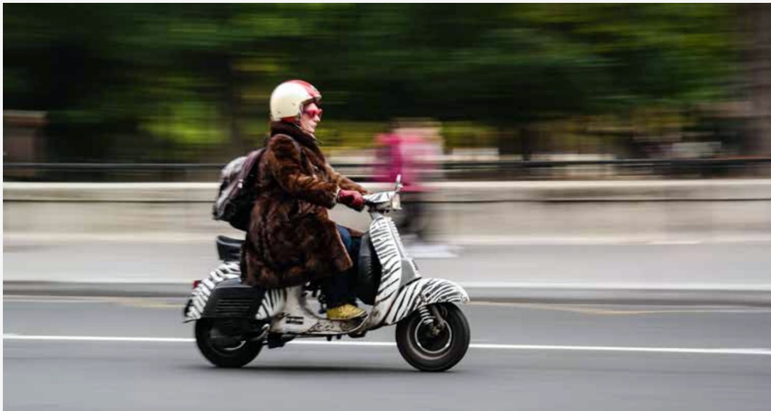
Faux fur and red glasses on a zebra scooter. ~ Paris