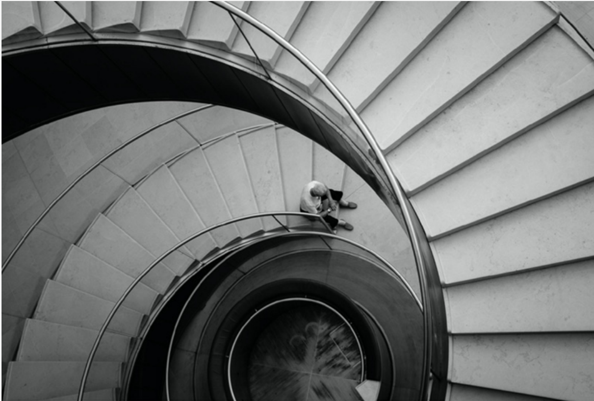
Tired museum-goer ~ Le Louvre, Paris