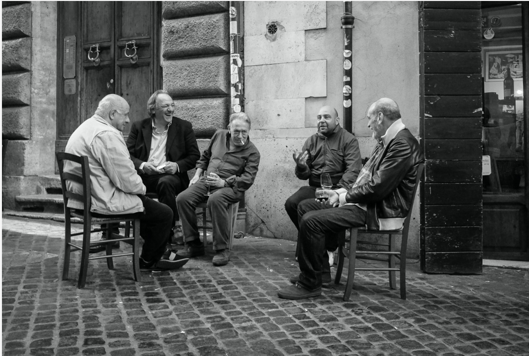
Hand gestures often reflect a culture. ~ Rome.