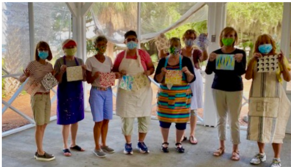
Mask Making Workshop