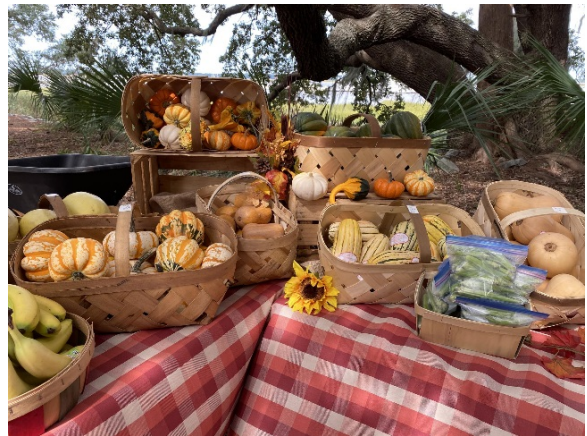
Pasture Shed Farms' Produce Stand