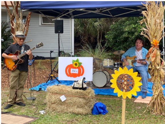
RKs at VAC's Afternoon in the Park

In October, blessed with gorgeous weather, we were able to host An Afternoon in the Park, a fall festival in the Marina Gazebo and surrounding grounds. Dataw residents gathered to celebrate autumn with live music by the RKs, food, produce and, naturally, beautiful arts and crafts. Other clubs were invited to participate: we were joined by the Garden Club, the Dataw Quilters and the Dataw Island Yacht club. With the generosity of our members, we held a raffle whose proceeds were donated to the very worthy Good Neighbor Clinic on St. Helena Island. It was a perfect opportunity to experience an autumn fair while maintaining safety precautions (masks and social distancing).