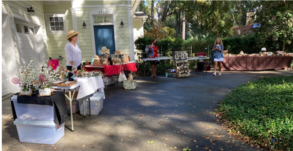
Mistletoe Market Vendors on Spring Well