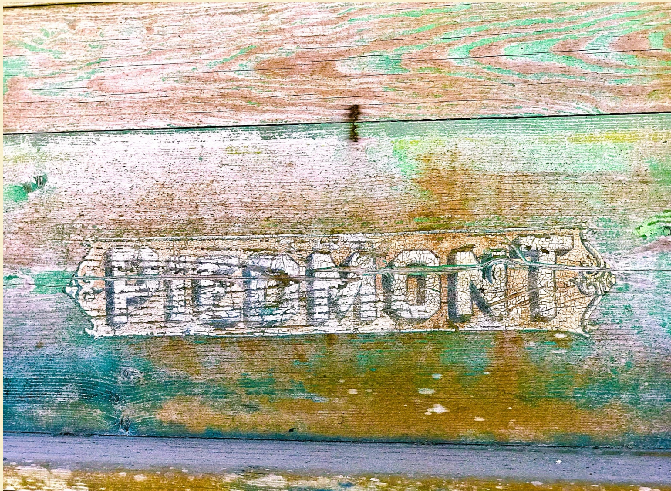
PIEDMONT WAGON EXPRESS...Susan Churchill