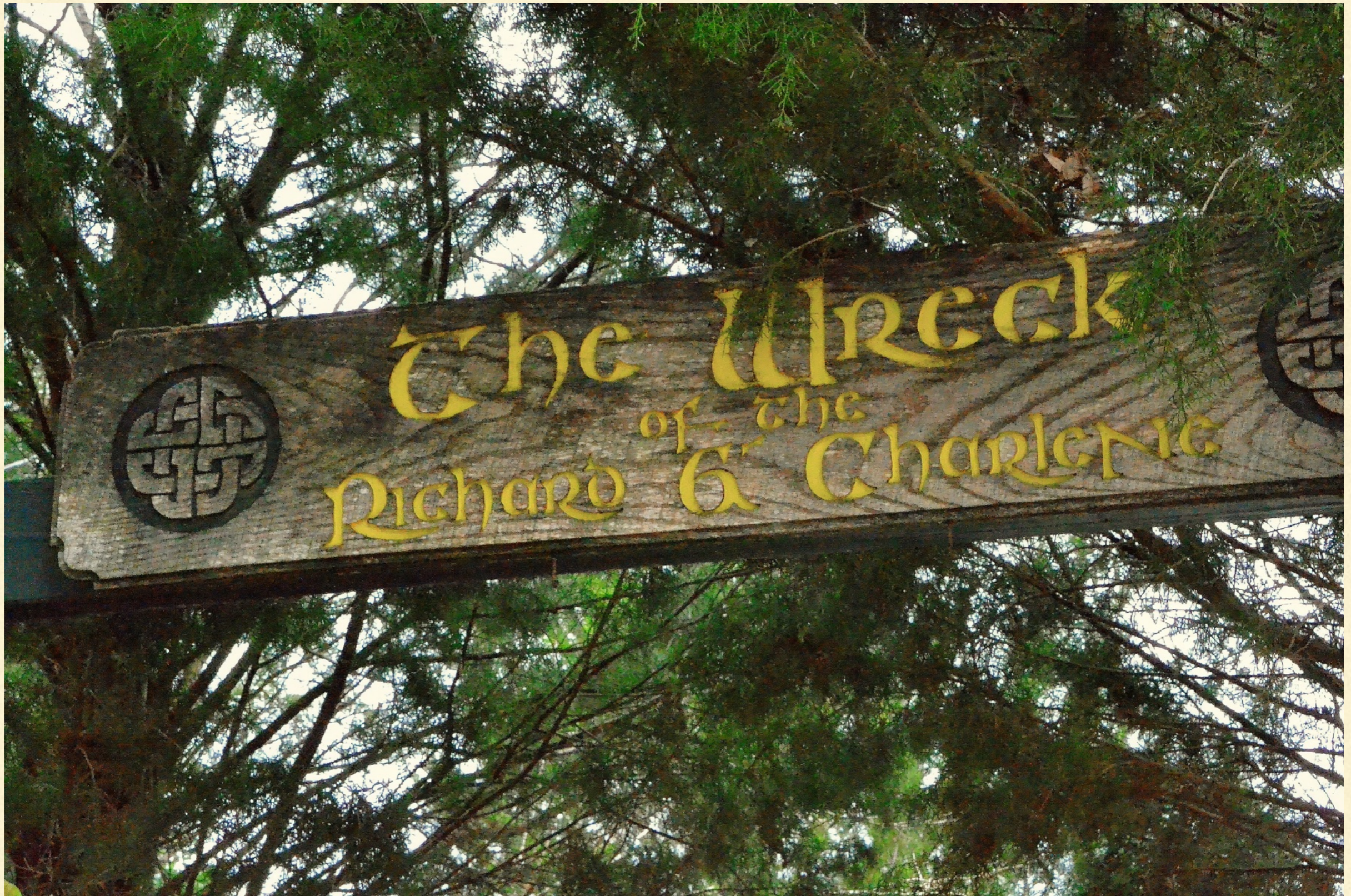
THE WRECK - DAMAGED BY HUGO...Dick Golobic