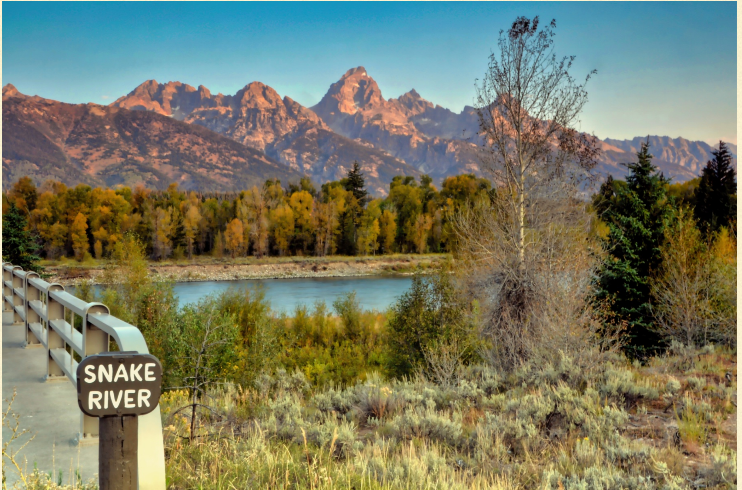
SIMPLE SIGN AT MAIN ENTRANCE TO GRAND TETON NP