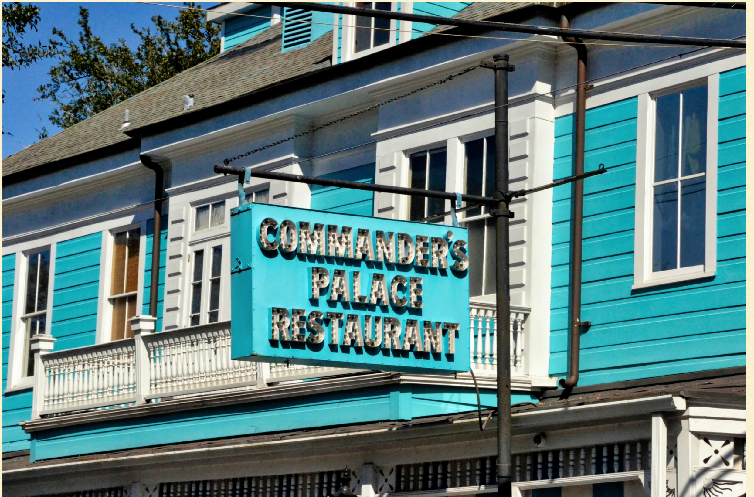
FAMOUS NOLA RESTAURANT...Dick Golobic