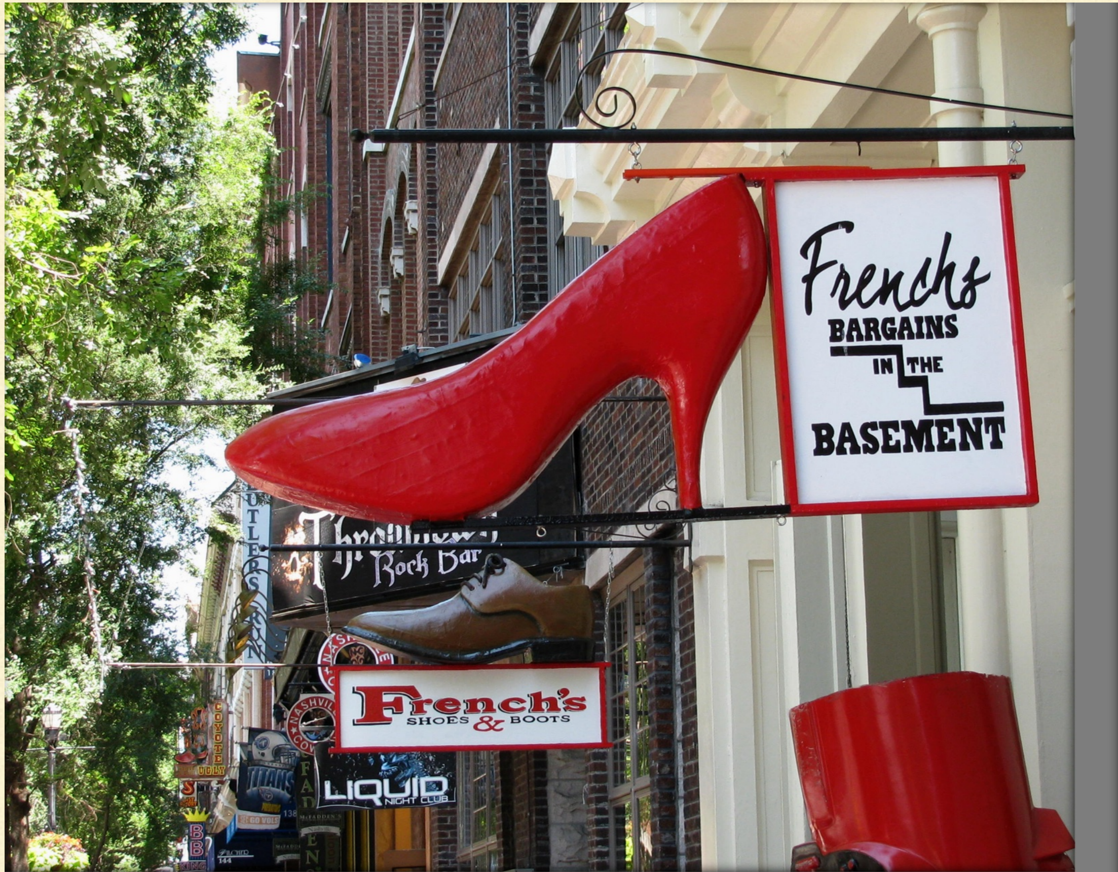
SHOPPING IN NASHVILLE...Bill Tremitiere