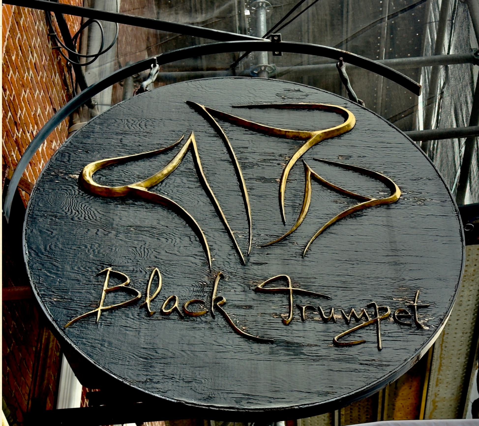
BLACK TEXTURE...Marcea Gustafson