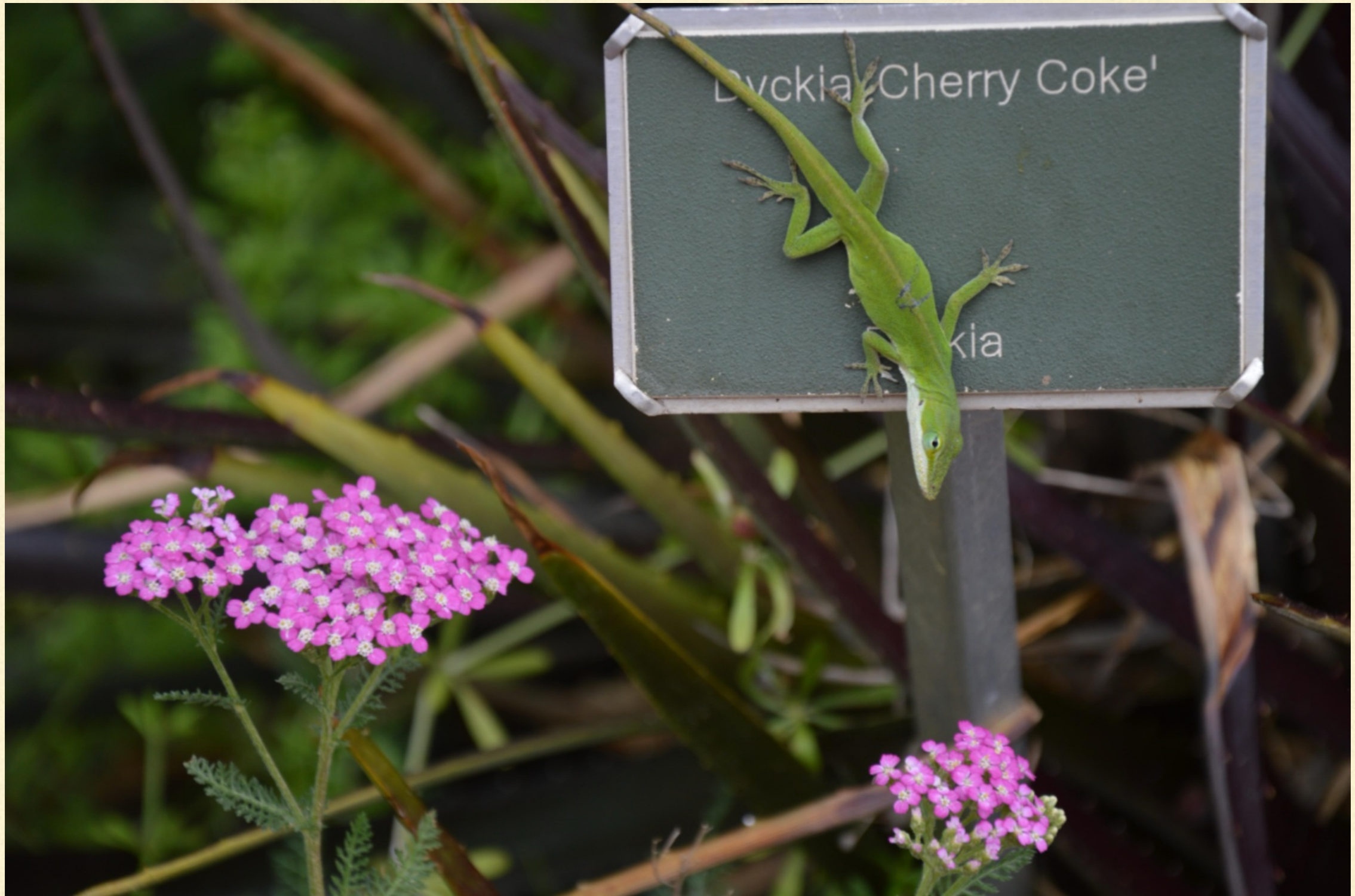
RIVERBANKS ZOO & GARDEN, Columbia, SC ...Denise Mignogna