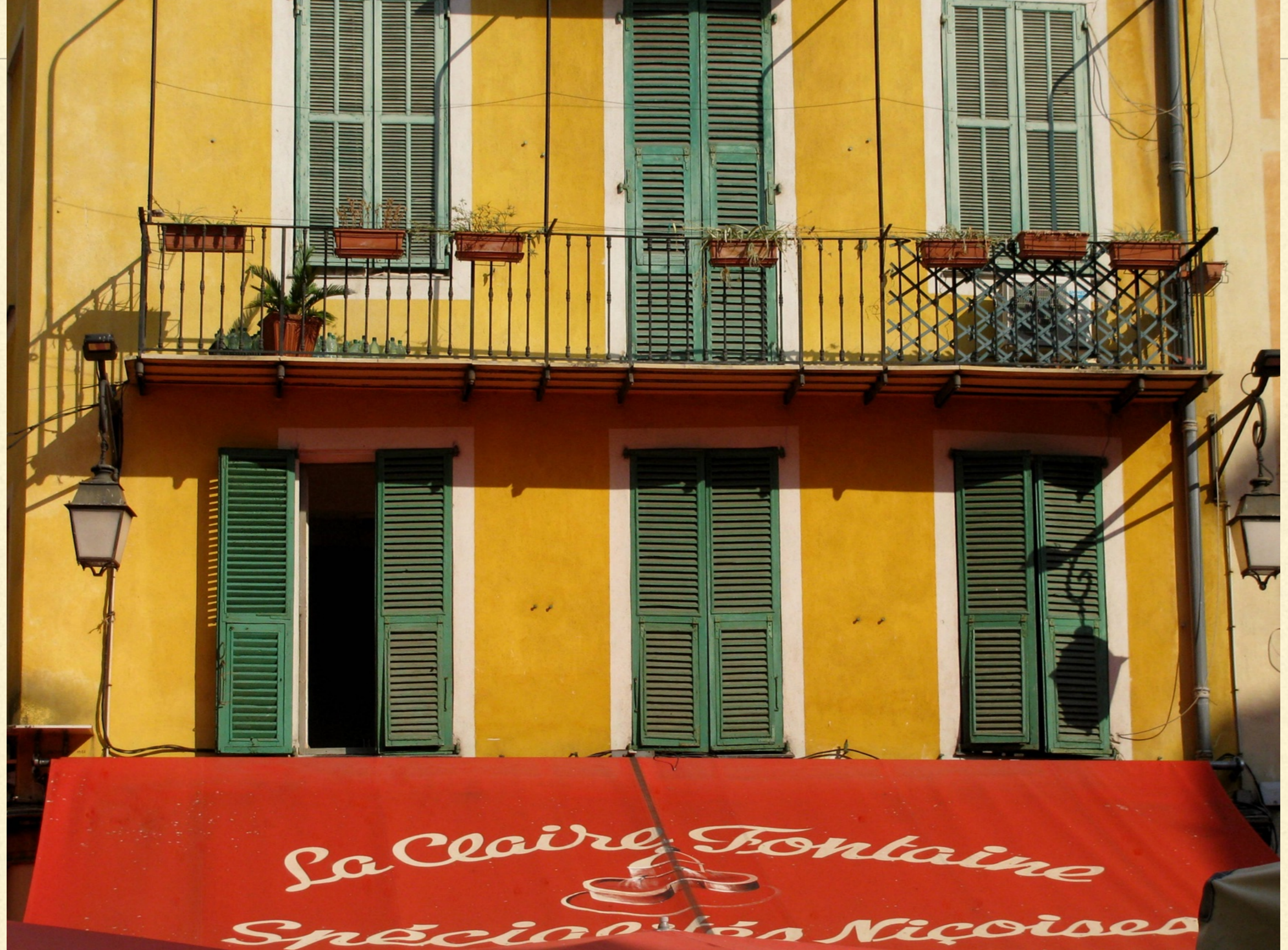
IN NICE, FRANCE...Bill Tremitiere