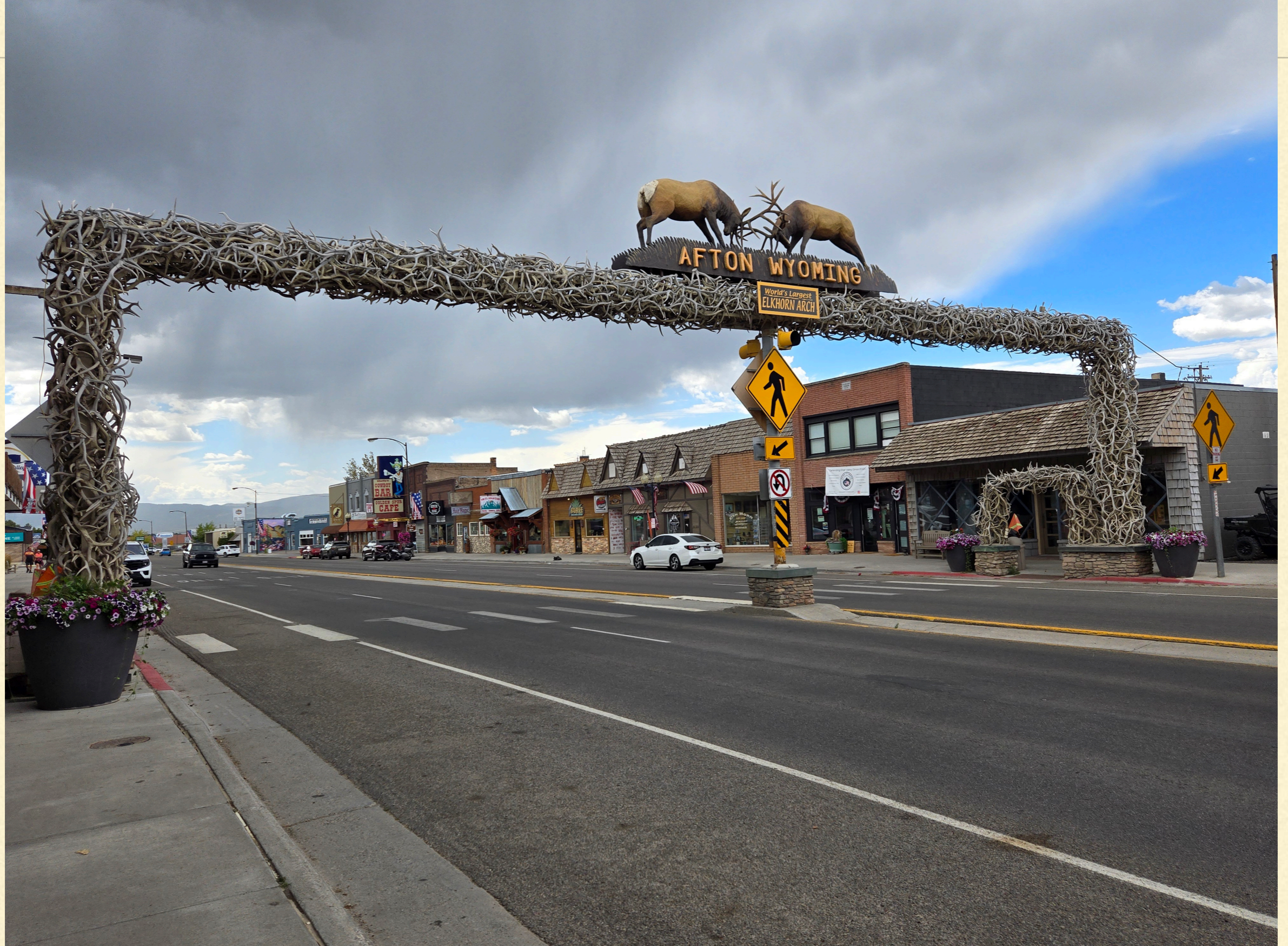
AFTON, WYOMING...Denise Mignogna