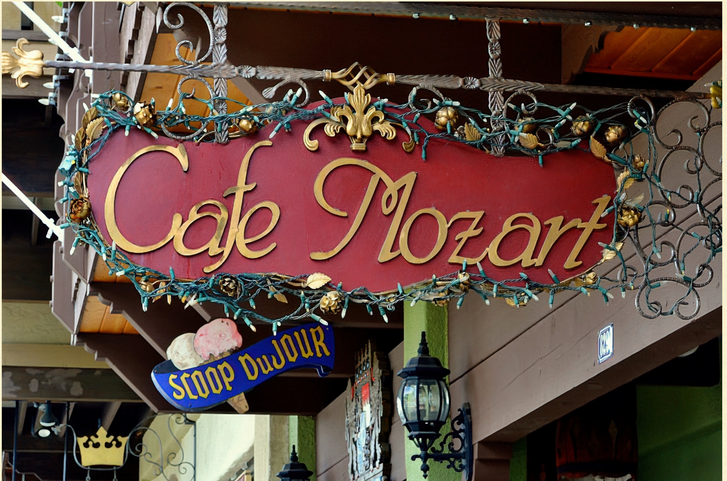
RESTAURANT IN LEAVENWORTH, WA...Dick Golobic