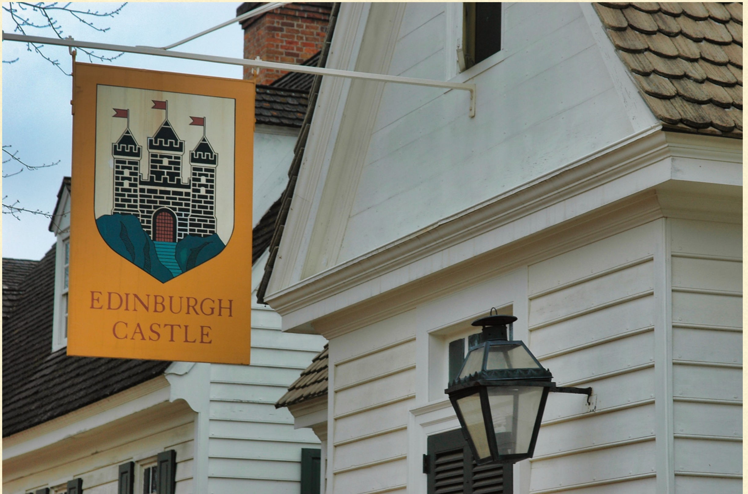
HISTORIC WILLIAMSBURG (HW) SHOPPE SIGNS