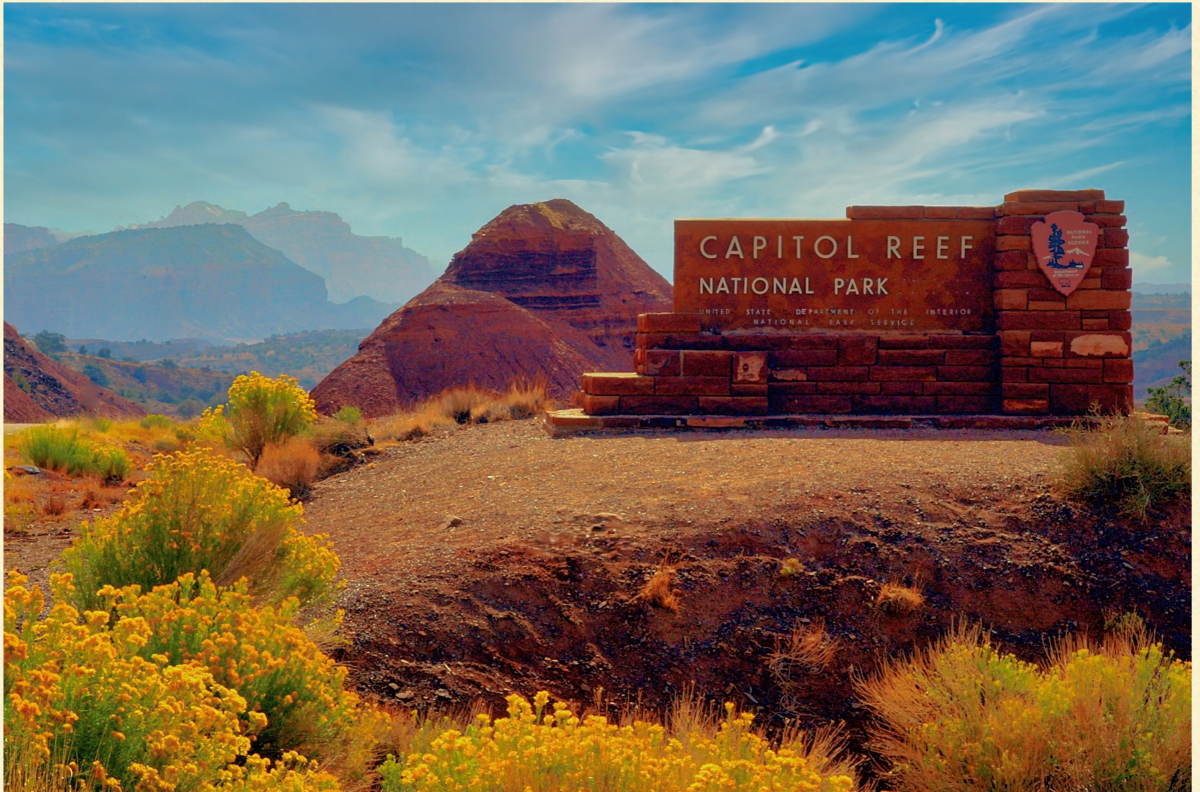
NATIONAL PARK ENTRY SIGNAGE...Dick Golobic