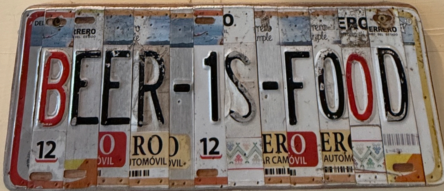
CREATIVE TAGGING...Jane Uecke