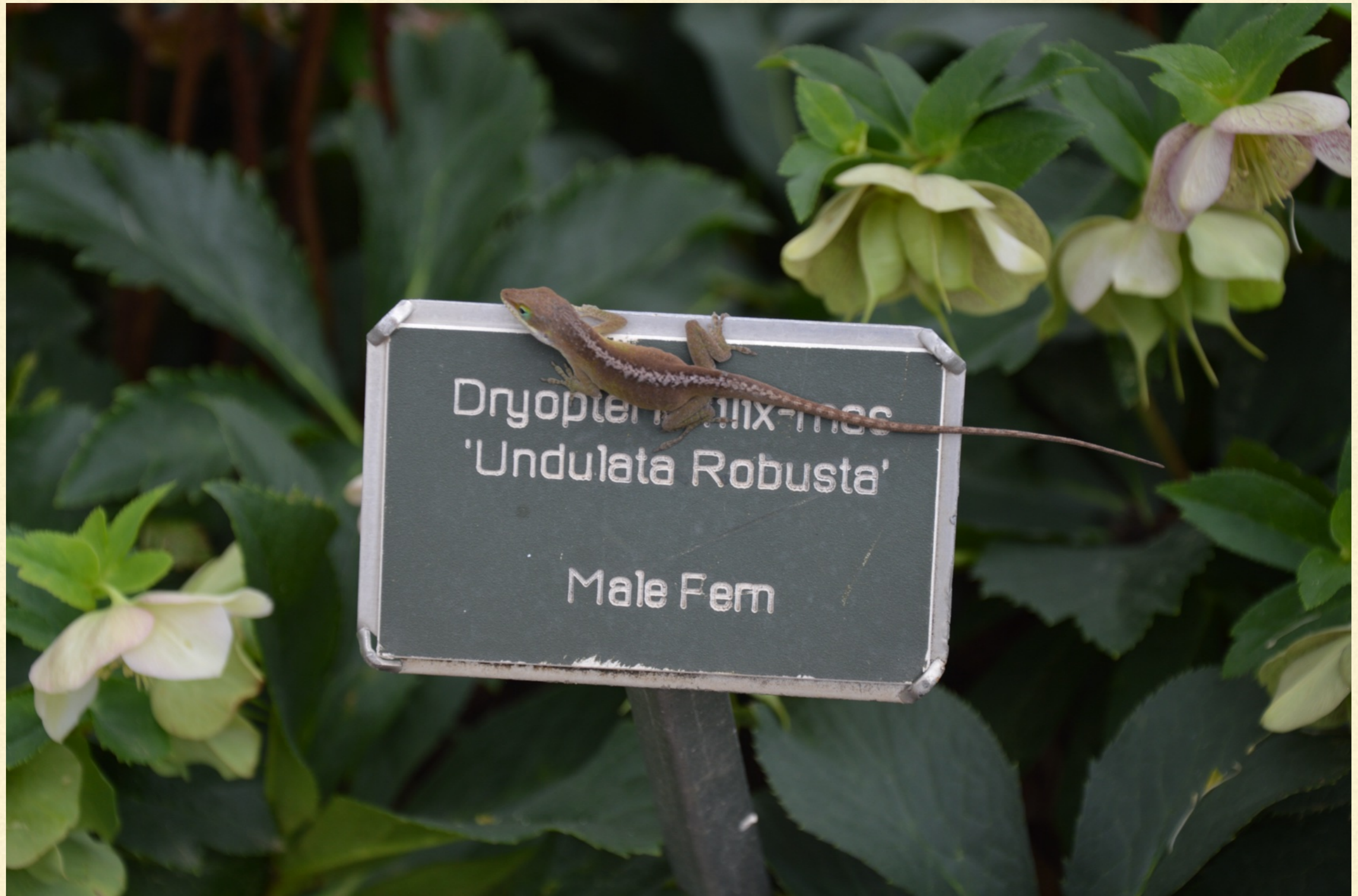
RIVERBANKS ZOO & GARDEN, Columbia, SC ...Denise Mignogna