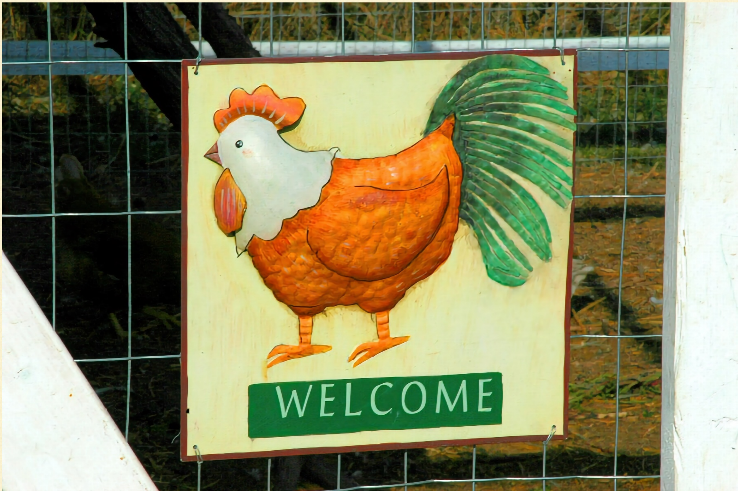
MONTANA BACKYARD FARM...Dick Golobic