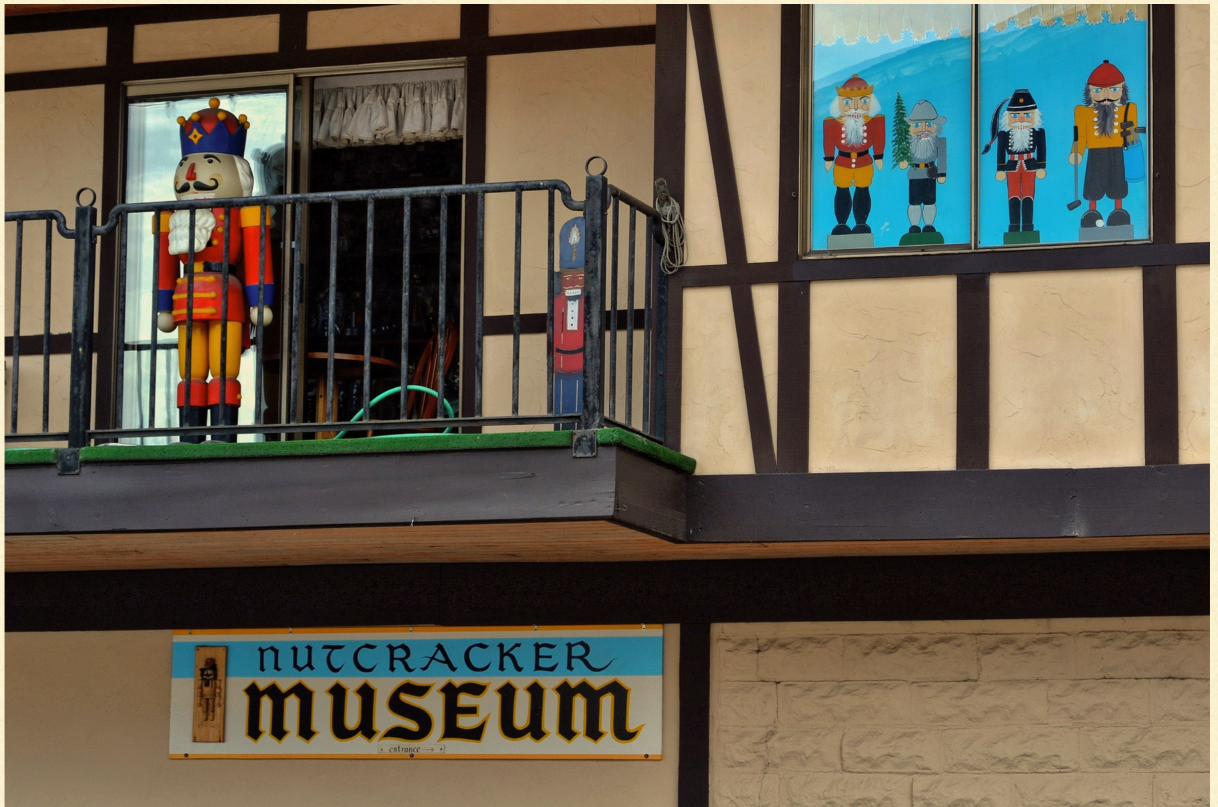
SIGN AND PRODUCTS...Dick Golobic