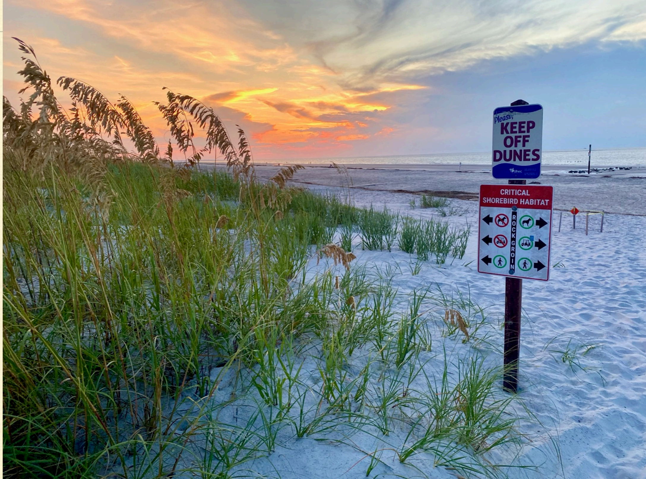
HUNTING ISLAND CAMPGROUND BEACH ...Louisa Stewart